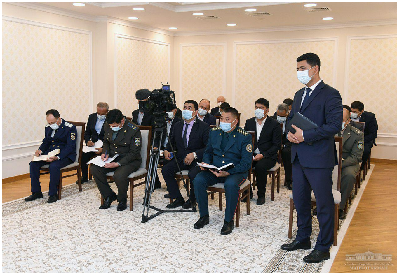
Following the meeting, President Shavkat Mirziyoyev left for Tashkent.