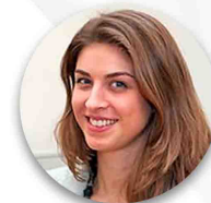
Ла Тойя Ваха

A scientific and practical conference was held on “The experience of the Central Asian countries and the EU in rehabilitation and reintegration of repatriates”.