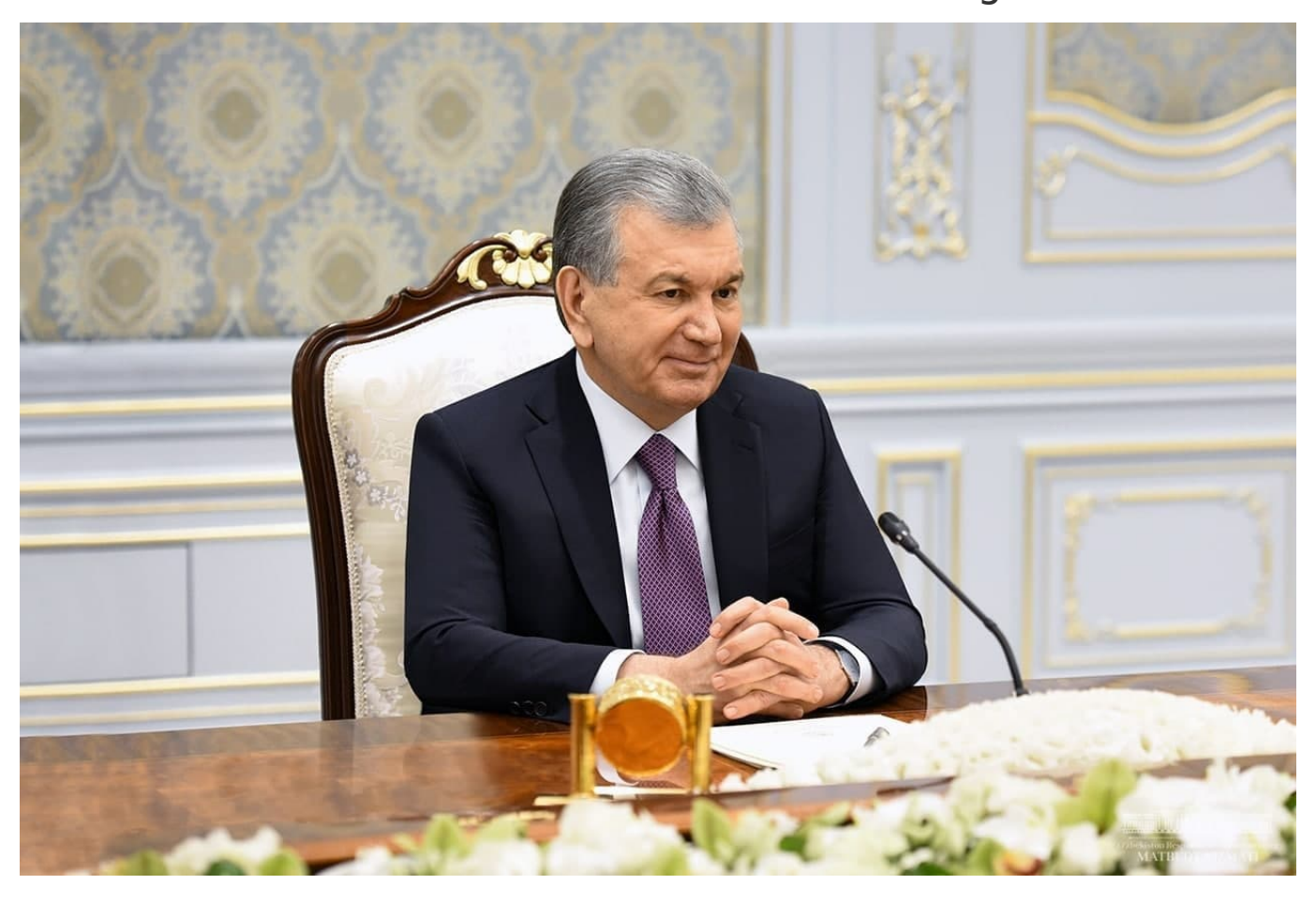
On 2 February, President of the Republic of Uzbekistan Shavkat Mirziyoyev received Adviser to the Prime Minister of the Islamic Republic of Pakistan Abdul Razak Dawood.

The parties exchanged views on prospects for the development of mutually beneficial cooperation between Uzbekistan and Pakistan.